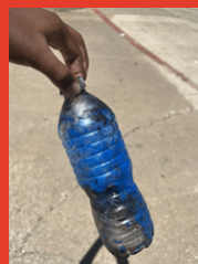
Hydrodipping in Art Class